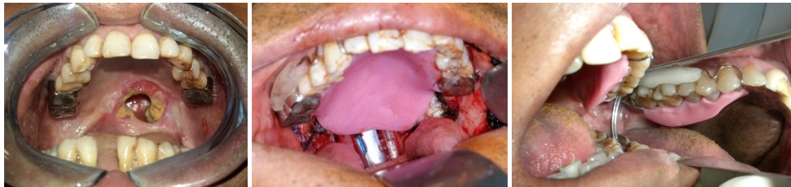
Figure 1. (a) Intraoral defect (b) Obturator in place (c) Mandibular guiding plane prosthesis