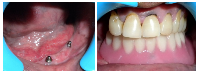
Figure 4. (a) Implant placement in residual mandible (b) Retentive functional denture in mouth

also, educating the patients with appropriate oral hygiene methods to preserve the optimum oral health and prevent future problems.