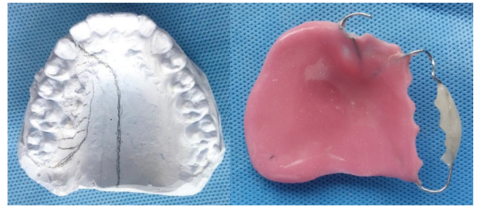
Figure 3. (a) Treatment planning on diagnostic cast (b) Preoperative surgical obturator

MFP's proves to have an essential contribution in assessing the possibility of recurrence during long-term follow-up visits [21]. So