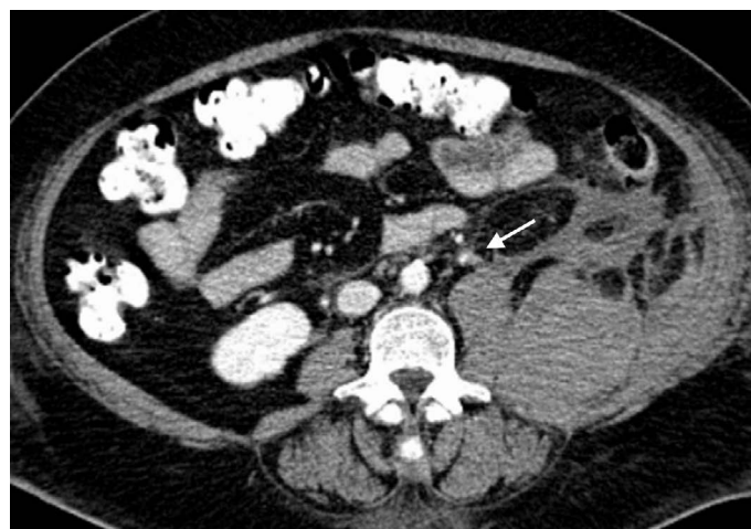
Figure 2. Urgent CT-scan, suspecting an origin of the bleeding on the right lumbar artery.