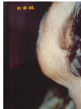
Figure 4. Image of swelling of the right parotid gland.

erythematous, measuring approximately 0.5 to 1.2 cm in diameter in the belly and the posterior portion of the tongue. An incisional biopsy was performed, whose histopathological anatomical result was of non-specific chronic inflammatory process, in both cases. After the result, a laser therapy with low power intensity (Gallium Arsenide and Aluminum - GaAlAs) at 790 nm and 30 mW was scheduled for 2 minutes in a punctual manner on each lesion at an energy density of 4 J / Cm 2 , repeating the application after 24 hours and not having undergone a clinical examination of the lesions (Figure 5). Severe hyposalivation made it impossible to measure salivary flow, buffer