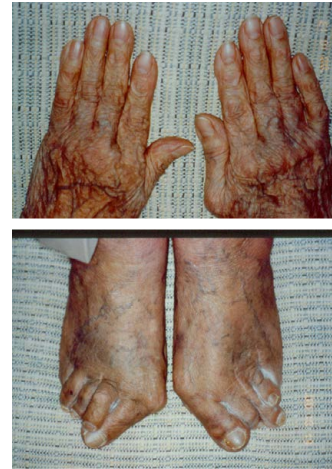
Figure 2 (A & B): Image of the silicone prostheses in the backs of the hands and feet bilaterally performed in Switzerland, however they were rejected twice.