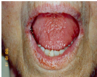
Figure 5. Anterior view presenting angular cheilitis, dry and cracked lips and fissured and despalpated tongue. Photo after removal and treatment of lesions with laser therapy.