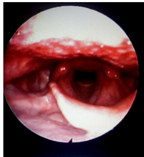
Figure 2. Inter arytenoids and vocal cords oedema and congestion

There is increasing evidence that GERD and helicobacter pylori may be associated with chronic non-specific laryngopharyngeal diseases [12]. Sometimes, patients seem not to be aware about the extent of GERD or H. pylori and their associated extraesophageal laryngopharyngeal symptoms may be the early presentation. Apart of that fact is the patients with GERD often may become symptomatic in the upper respiratory tract, and laryngopharyngeal findings are subtle and sometimes hard to detect. The patient was mainly complaining of dysphagia, horsiness of voice and chronic dry cough for more 3 months, post nasal discharge, foreign body sensation, chocking, recurrent