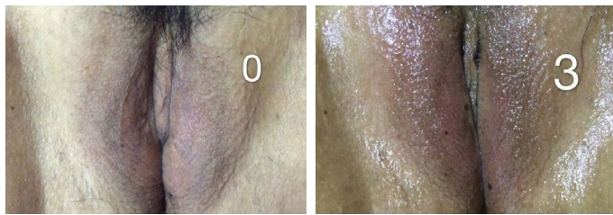
Figure 7. Baseline situation (left, marked with “0”): quite severe 3-years vulvar atrophy; at right (marked with “3”), evolution of atrophy after the third DQRF session. Woman’s age: 40; operational power: 8-12%.