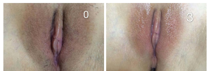
Figure 6. Baseline situation (left, marked with “0”): quite severe 1-year vulvar atrophy; at right (marked with “3”), evolution of atrophy after the third DQRF session. Woman’s age: 37; operational power: 8-12%.

Table 1 (subjective appreciation of current vulvar aesthetics) and Table 2 (discomfort and self-esteem and couple-relationship problems incurred in daily life) illustrate the perceived levels of gratification reported by the sampled women before each of the four DQRF sessions and at follow-up interview. The distribution of categorical assessments showed a statistically significant shift compared with baseline towards more subjective satisfaction before the second rejuvenation session; the