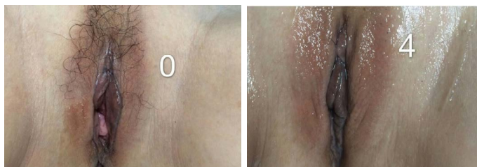
Figure 8. Baseline situation (left, marked with “0”): moderate to severe 2-year vulvar atrophy; at right (marked with “4”), evolution of atrophy 2 weeks after the fourth DQRF session. Woman’s age: 34; operational power: 8-13%