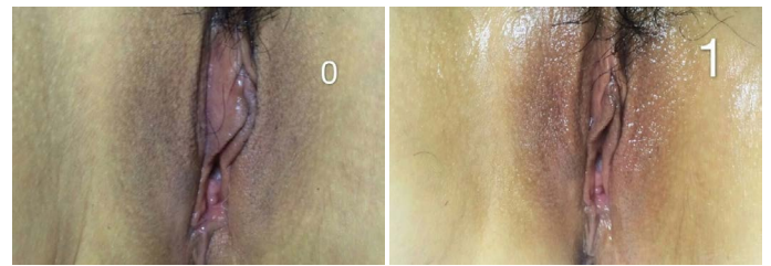
Figure 3. Baseline situation (left, marked with “0”): moderate yet steadily worsening 2-year vulvar atrophy; at right (marked with “1”), evolution of atrophy after the first DQRF session. Woman’s age: 29; operational power: 10%.