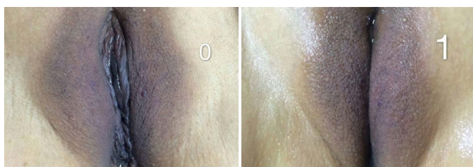
Figure 2: Baseline situation (at left, marked with “0”): 1-year yet rapidly evolving vulvar atrophy; at right (marked with “1”): evolution of atrophy after the first DQRF session. Woman’s age: 35; operational power: 8-11%.