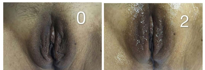
Figure 4. Baseline situation (left, marked with “0”): moderate vulvar 2.5-year atrophy; at right (marked with “2”), evolution of atrophy after the second DQRF session. Woman’s age: 36; operational power: 9-12%.