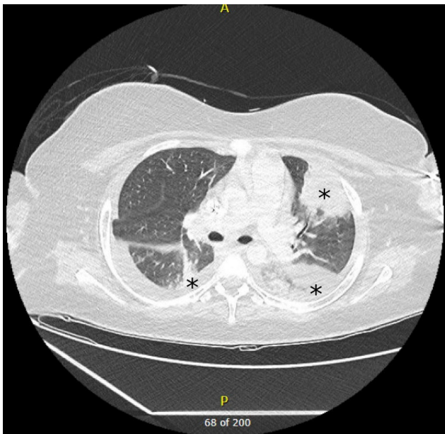
Figure 1. CT findings with infiltrates suggestive of multifocal pneumonia (black asterisks)