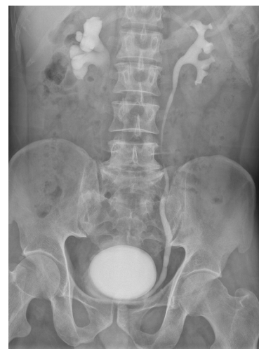
Figure 1. Showing a giant bladder calculus in the pelvic area

Systemic physical examination and rectal examination findings were normal. A complete urologic examination revealed a palpable solid oval-shaped mass, 8 cm in size, which originated from suprapubic region of the bladder. Both Color Doppler ultrasound of urinary system and intravenous pyelography(IVP) produced that a large, rounded calcified mass in the pelvis (Figure 1). Undoubtedly, it is difficult for endoscopic techniques to remove such a giant bladder calculi completely. Hence, open cystolithotomy was performed (Figure 2). More interestingly, although the bladder calculi size was relatively huge, it was removed easily and completely without adhesion to the bladder wall. The extirpated bladder calculi measured 8.0× 10.0 × 6.0 cm, and weighed 293.1 gram (Figures 3 and 4). The postoperative 3 months follow-up was uneventful and without any urologic complaint. The calculus was analysed and found to be composed of cystine.