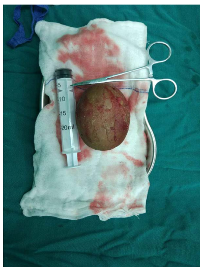
Figure 3. An intraoperative photograph showing the bladder calculi