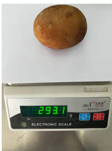
Figure 4. The extirpated calculi weighed 293.1gram

develop in multiple stones in the presence of urinary stasis [4]. With the rapid development of China's economy and health care, bladder stones weighing more than 100 g are extremely rare. Undoubtedly, the present case report was more interesting. Firstly, a review of the literature shows that similar studies of giant bladder stone in china are scanty. Secondly, the extremely large bladder calculi occupied most of the bladder and pressing on the orifices of the ureters, leading to the presence of hydronephrosis. Thirdly, the most important point was that we found no obstructed bladder outlet during the operation. The reasons we analyzed were that the bladder stone formed after an upper urinary tract calculi descended into the bladder a long time ago.