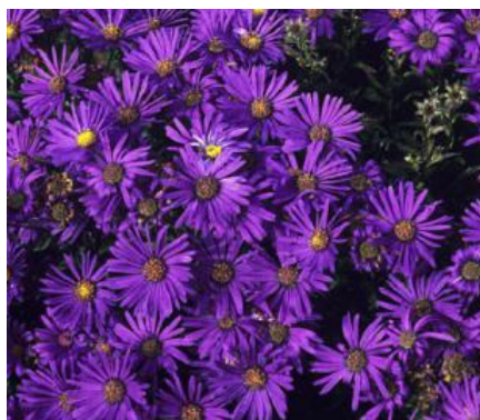
Figure 1. Symphotrichum novae-angliae