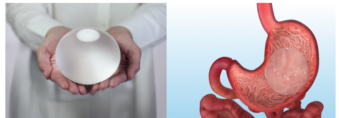
Figure 3. Illustration of orbera balloon outside and inside patient