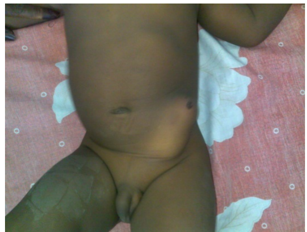
Figure 1. Three years child with acute handlebar abdominal hernia.

Acute abdominal wall hernias caused by traumatic force are exceedingly rare [1]. There are fewer than 50 cases reported in the