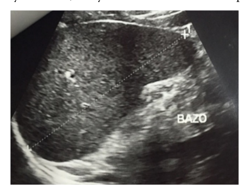
Figure 1. Spleen enlarged with 13 cm length.

With the possibility that the cause of thrombocytopenia were due to cirrhosis imaging studies were requested, a total abdominal ultrasound and a portal vein Doppler reported liver size of 13 cm with heterogeneous pattern and irregular edges, the portal vein with a flow of 15 -20 cm per second spleen enlarged with 13 cm length (Figure 1), the gallbladder with a 2.1 \times 1.4 cm litho (Figure 2), no free liquid was identified; given these findings suspicion of cirrhosis and calculous chronic cholecystitis is confirmed and patient is prepare for cholecystectomy previous platelet transfusion. Cholecystectomy surgery was perfomed where a nodular pattern liver was visualized (Figure 3); a biopsy that reported hepatic tissue with rounded nodules formation of fibrous connective tissue with acute and chronic inflammatory infiltrate, fatty macrovascular metamorphosis 30%