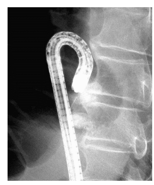
Figure 2b. Fluoroscopic image of endoscopic obliterative therapy.