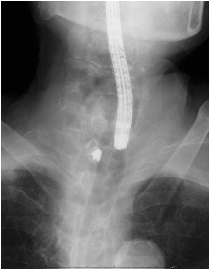
Figure 2. Combined use of endoscopy and X-ray fluoroscopy.