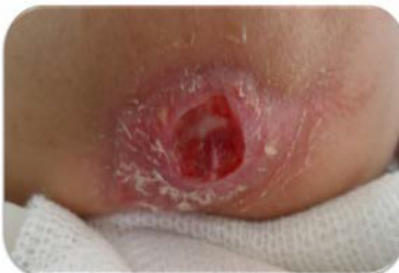
Figure 5. Disinfection of cutaneous lesion.