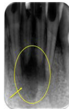
Figure 8. Endodontic treatment of teeth 32, 42 and filling with CaOH 2 mixed with Clona.