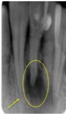
Figure 3. Endodontic treatment of teeth 31 and 41 :filled with CaOH 2 mixed with Clona (Note the periapical lesion).