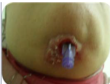
Figure 6. Locating cone with capillary tips in witch gutta percha.

The radiography shows the extension of the periapical image to the 42 (Figure 7).