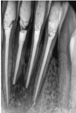
Figure 13. Radiological control 6 months later: Bone healing.