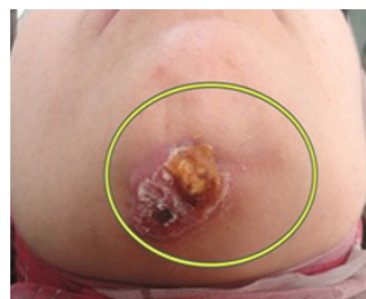
Figure 1. Aspect of an infected ulceration.

The lesion was disinfected with Chlorhexidine 0.2% (Figure 5) and a locating cone was made to check the causative tooth by means of a capillary tips in which we inserted a cone of gutta percha (Figure 6).