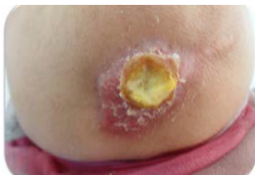
Figure 4. 15-day control: no improvement.