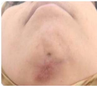
Figure 12. Clinical control 6 months later: good evolution.