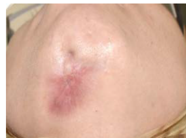
Figure 10. At 2 months: fistula is no longer productive.

prolong the effect of CaOH 2 and a control appointment was given one month later.