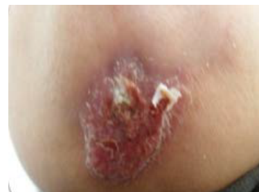
Figure 9. After one month : Slight improvement of the skin lesion; Renewal of the CAO 2 mixed with an oily carrier (oil of liver of moru).