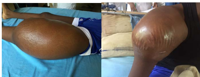
Figure 2. Presentation.

Clinical studies that aims to identify prognostic factors in the overall survival of patients with osteosarcoma have been published but results have been varied as a result of non harmonisation of the various methodologies [5]. The number of cases seen in our study over a 16 month period showed an average of 1.3 cases per month. This is an indication of the rarity of the condition as our facility being a referral centre with a radiotherapy facility is sufficiently equipped to manage these cases in the sub-region. Overall, the age distribution of these tumours in our study was unimodal unlike the bimodal pattern described in the literature [3,6]. The first and larger peak of incidence is found to occur during the second decade of life and the average age of the patients in our series was in the second decade. Patients with primary osteosarcoma are in the first peak and the results from our series are concordant with this picture. The second and smaller peak is seen among patients over 40 years of age, and has been found to be secondary to a pre-existing bone abnormality like pagets' disease. The variables of age and gender have been shown to be prognostic factors