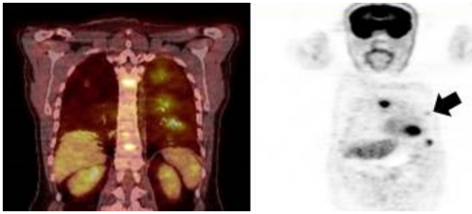
Figure 2. On PET/CT increased metabolic uptakes were detected in mass, multiple lytic bone lesions and also a nodular lesion (black arrow) in retroareolar area of left breast.