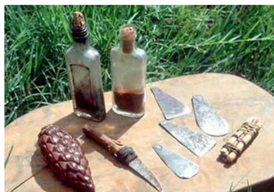
Figure 1. Crude instruments used by practitioners

Female genital mutilations are mostly performed on young girls by local practitioners with crude instruments (razor blades, scissors, kitchen knives, glass, sharpened rocks), without proper anesthesia, and under poor sanitation conditions. After mutilation, girls usually have their legs bounded together for a couple of weeks to “allow” scar tissue formation (Figure 1) [3-5].