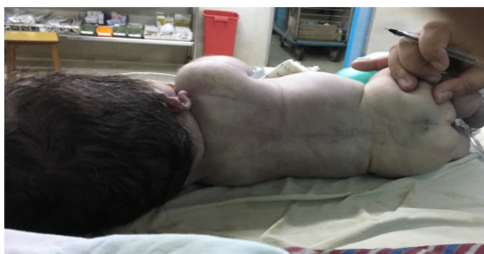
Figure 3. Showing flat back and spine with pit/dimpling over sacral region