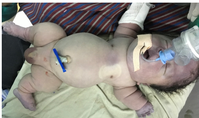
Figure 2. Showing micromelia, macrocephaly, narrow thorax and protruded abdomen