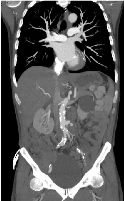
Figure 2. Coronal view of infrarenal abdominal aortic pseudoaneurysm

soaked Dacron graft was used for repair. Proximal and distal anastomosis were formed with a 3-0 Prolene suture in a running fashion. Hemostasis was achieved. The patient tolerated the procedure well [3].