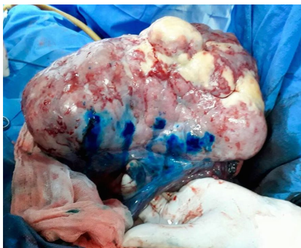
Figure 1. Blue dye in transoperatory, ovary tumor before to resection

The germinates ovary tumors in our services, receives standing comprehensive surgery, in a different treatmetment than Vicus report,