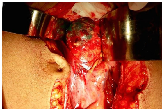
Figure 2. Retroperitoneal open and and blue dye in paraaortic nodal