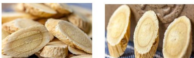
Figure 1. The chemical structure of astragaloside IV (left) and cycloastragenol (right).