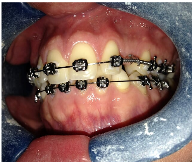
Figure 3. Image after orthodontic-surgical technique

lingual, cervico-occlusal and mesio-distal directions, as well as its relation with adjacent structures [7,8].