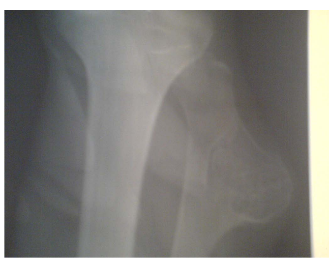
Figure 1. Lesion involving the proximal fibula.