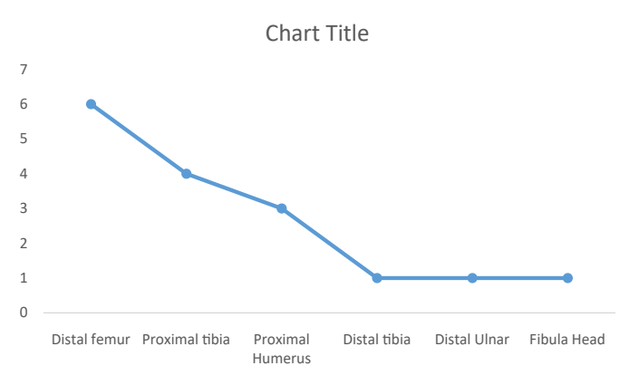
Table 2. Anatomic distribution of lesion.

in the 3 cases of ABC involving the fibular head, proximal humerus. The average follow-up was 33.6 months and complication of foot-drop was seen in one patient. A case of recurrence was seen for which he had a re-operation with bone cement and fixation with implant in some other facilities.