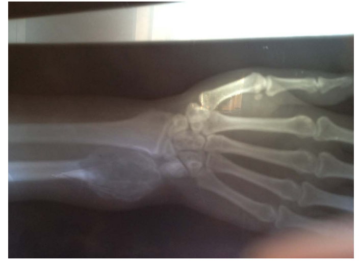
Figure 2. Lesion involving the distal ulnar.