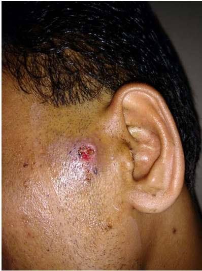
Figure 1. Showing entry wound of Bullet in left preauricular region.

nearby vital structures [3]. Gunshot injuries are often associated with significant morbidity and mortality. Such injuries in the maxillofacial region have unusual and complicated presentation [4]. The anatomical location of the bullet poses a surgical challenge due to its proximity to crucial neurovascular structures.