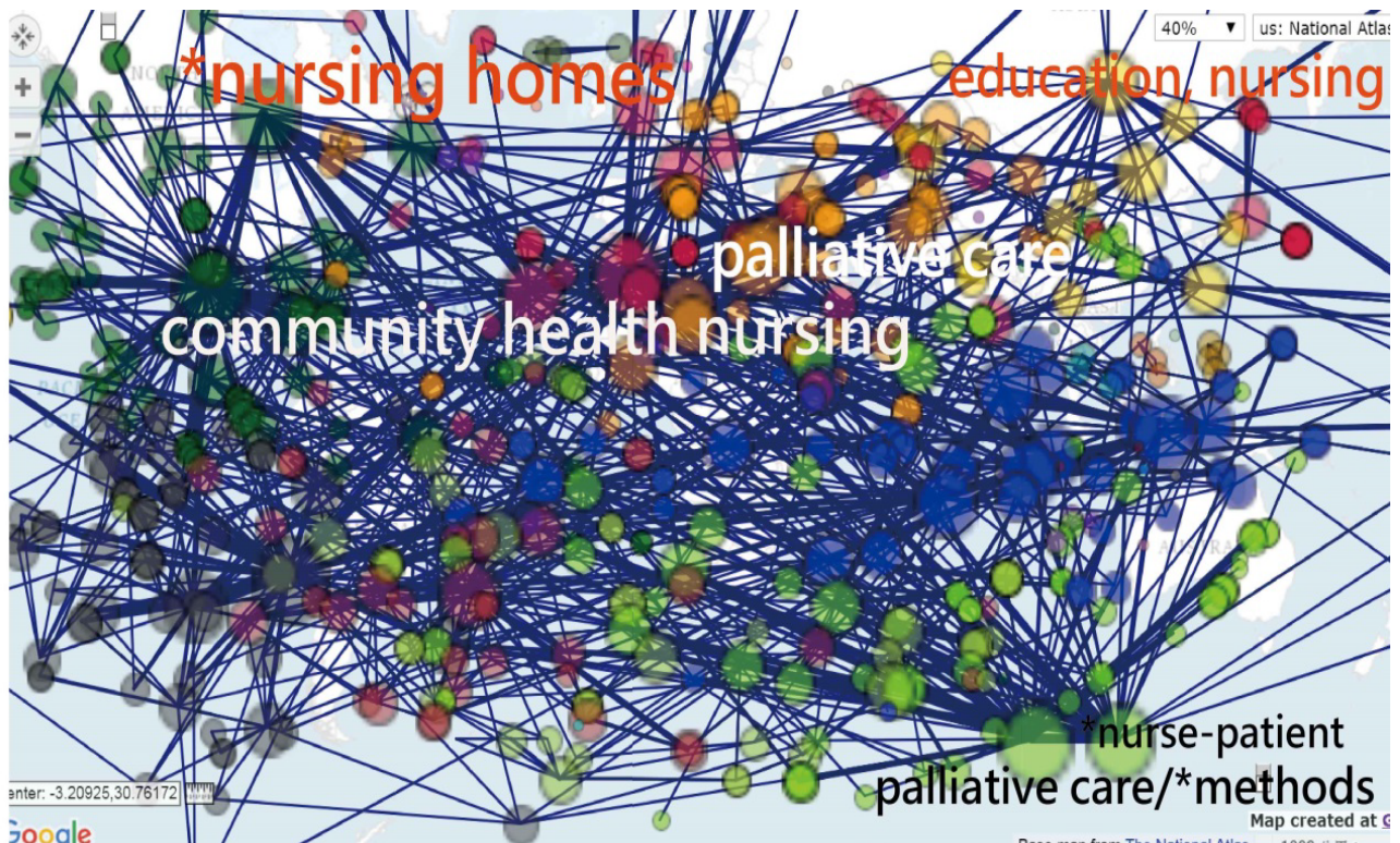
Figure 3. Mesh terms in papers regarding nursing and palliative.

Several algorithms and measures have been developed and used with SNA to graphically explore data. If we investigate whether any author or paper most fits the research domain of a journal and its scope within the journal's keyword network, the centrality measures using SNA can be applied [8]. It means that the core subject can be analyzed using the centrality measure [23, 27] yielded in SNA.