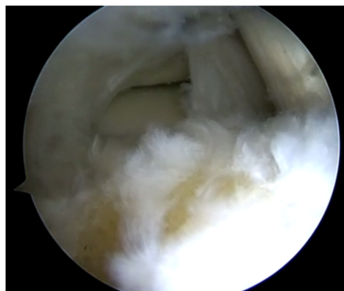
Figure 1. Posterior view ankle after resection of the posterior facet of the talus

*Correspondence to: Liselore Maeckelbergh, University Hospitals Leuven, Department of orthopaedic surgery, Weligerveld 1, 3212 Pellenberg, Belgium, E-mail: liselore.maeckelbergh@hotmail.com