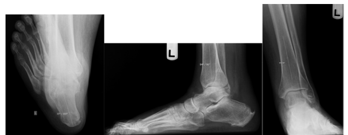
Figure 1. Preoperative radiographs showing 15 degrees of heel varus, 84 degree anterior distal tibial angle, and 94 degree lateral distal tibial angle.

The ankle joint appeared incongruous with a small anterior joint impingement. The posterior aspect of the posterior subtalar joint