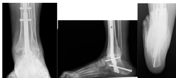
Figure 2. Radiographs 11 months post-operative. Full consolidation across the ankle and subtalar joints with hardware intact and alignment maintained.