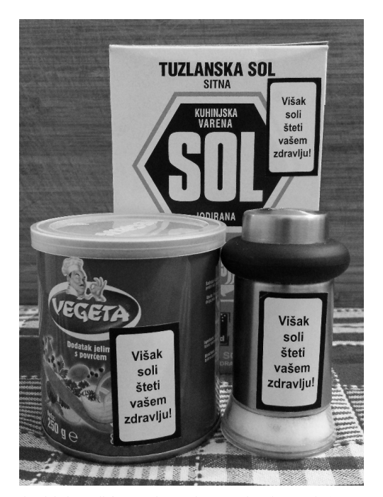
Figure 2. Warning labels on different salt containers, stating (in Croatian) "Too much salt is a health hazard".

Figure 1. Printed informative leaflet about salt intake (in Croatian), handed to all the study participants